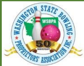
Director – Region 1